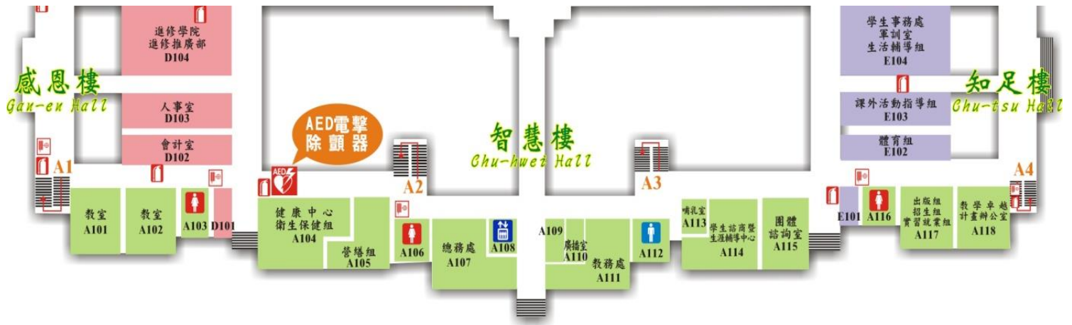
Administrative Services Chart

Here is the 1st floor plan of the Administration Building.